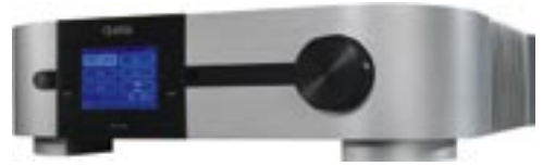
CAP-2100 INTEGRATED POWER AMPLIFIER