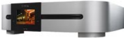
CDP-300 DVD PLAYER

The CDP-300 offers six high-quality analog audio channels as well as progressively scanned and scaled analog and digital video. The CDP-300 can output video for all rates covered in the HDTV specification, including 1080p on HDMI. As with other Delta series disc players, the CDP-300 features a TFT preview screen and touchscreen control to enhance and simplify operation. For more detailed descriptions, please visit the Classé Web site: www.classeaudio.com .