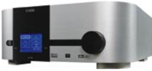
SSP-600 SURROUND SOUND PROCESSOR