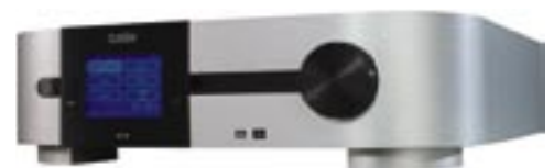
SSP-300 SURROUND SOUND PROCESSOR

As the heart of a multichannel system, Classé SSPs seamlessly process different audio and video formats in an easy to use controller. Performance, utility and beauty establish the SSP-300 and SSP-600 at the top of their class. The SSP-600 is based on the same processor platform, but goes beyond the performance benchmark set by the SSP-300. The SSP-600 offers enhanced audio by way of a balanced analog input pair and 7.1 channels of balanced analog out. A separate analog power supply section ensures optimum performance from these critical balanced circuits. For more detailed descriptions, please visit the Classé Web site: www.classeaudio.com .