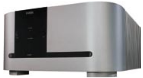
CA-M400 POWER AMPLIFIER

The CA-M400 is a 400W monaural amplifier. Balanced throughout, the CA-M400 also uses our 200W modules, but configured in balanced output mode. One module amplifies an inverted signal while the other handles a non-inverted signal. Our balanced output stage cancels noise and distortion and yields higher power without reducing low impedance drive capability. Music lovers seeking the benefits of high-end monaural amplifiers and multi-channel enthusiasts who can afford the price of admission will find the CA-M400 an ideal choice for a no-compromise Delta series Classé audio system. For more detailed descriptions, please visit the Classé Web site: www.classeaudio.com .