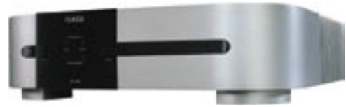
CA-2100 POWER AMPLIFIER