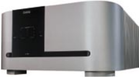
CA-3200 POWER AMPLIFIER

These amplifiers represent the best price/performance offering ever from Classé. Delta series amplifiers share important circuit blocks, adding to the performance benefits of using Classé amplifiers together in multichannel systems. Output channels are designed to be produced as 100W or 200W modules. These modules are designed to be used in one-, two-, three-, and five-channel models. This efficient approach yields a consistency of performance across the entire range, allowing Delta series amplifiers to deliver stratospheric performance at less than stratospheric prices. Delta series design features include balanced circuitry, overbuilt power supplies and oversized output stages to ensure the highest performance at every output level, with any loudspeaker. Enhanced protection circuits and intelligent power management add to the value and longevity of Delta series amplifiers while RS-232, IR and DC trigger controls make them well suited for any custom-installed or integrated system control applications.