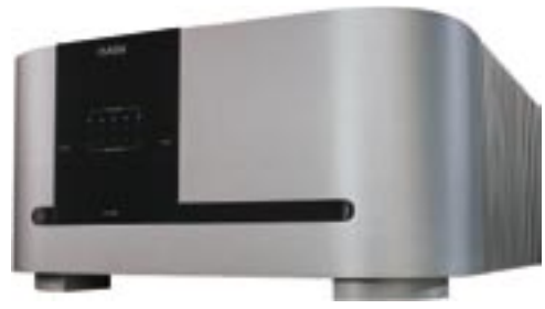
CA-5200 POWER AMPLIFIER

The two stereo amplifiers, CA-2100 and CA-2200, are rated at 100W and 200W per channel at 8 \Omega , respectively. The CA-2100 establishes a new entry-level Classé performance benchmark while the CA-2200 is simply our best stereo amplifier.