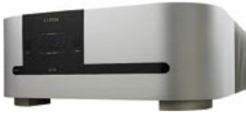
CA-5100 POWER AMPLIFIER