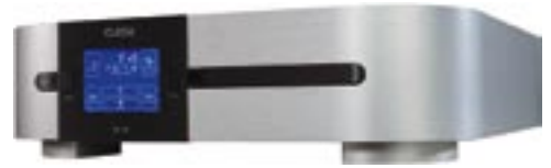
CDP-102 CD PLAYER